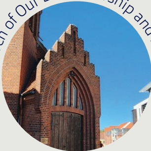
Church of Our Lady: Worship and music