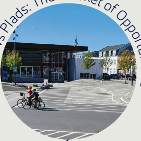
Bindslers Plads: The 'Market of Opportunities'