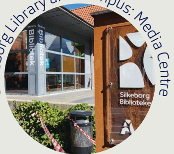
Silkeborg Library and Campus: Media Centre