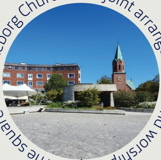
The square and Silkeborg Church: The joint arrangements and worship